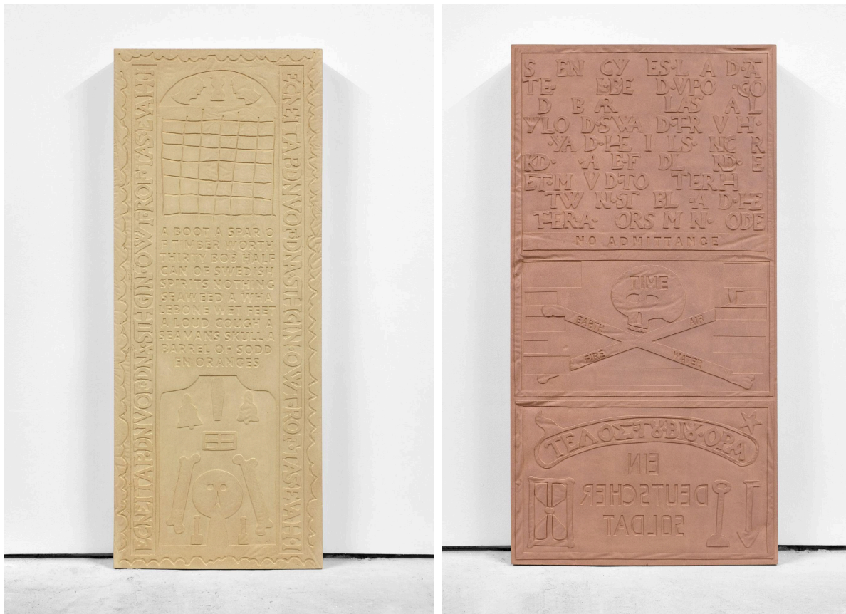
Beachcomber, 2024 (left) and Taxman, 2024 (right)