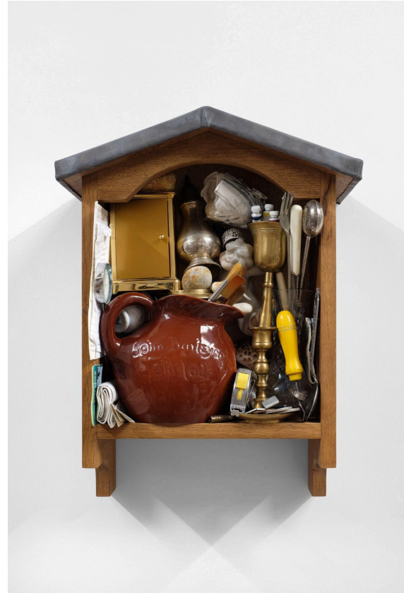
Fleeting , 2024 (left) and Pilgrim , 2024 (right)